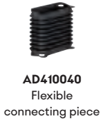
AD410040 Flexible connecting piece